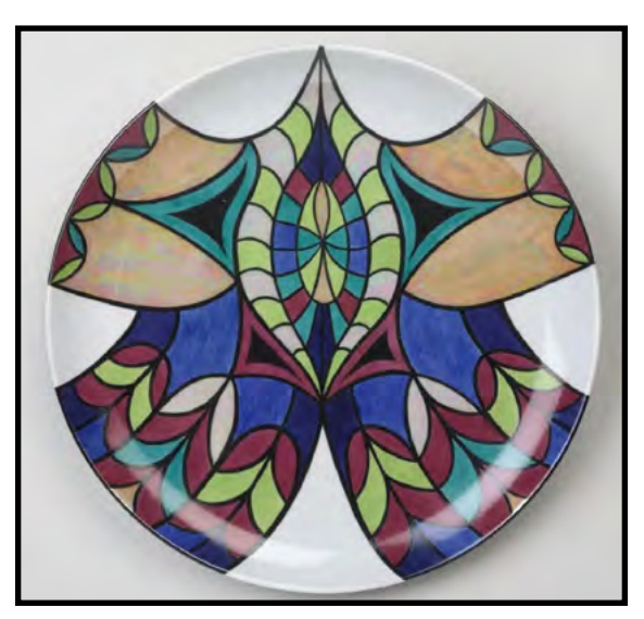
Hildegard of Bingen Place Setting for The Dinner Party by Judy Chicago (2021) ...