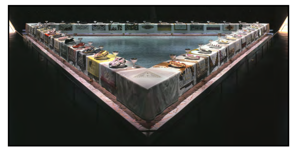
© 2021 Judy Chicago/Artists Rights Society (ARS). To see more, visit <u>www.brooklynmuseum.org/exhibitions/dinner_party</u>.

The Dinner Party is a monumental work of art on display in the Brooklyn Museum. Judy Chicago led hundreds of collaborators, including a core group of twenty-five people, over a period of five years to create this masterpiece.