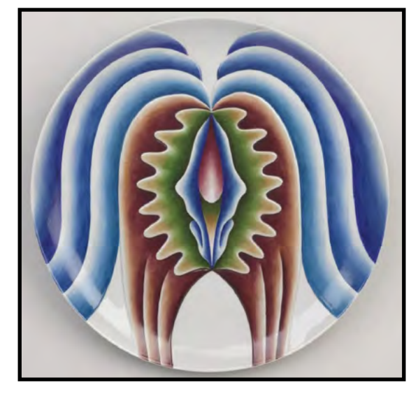
Hatshepsut Place Setting for The Dinner Party by Judy Chicago (2021)..