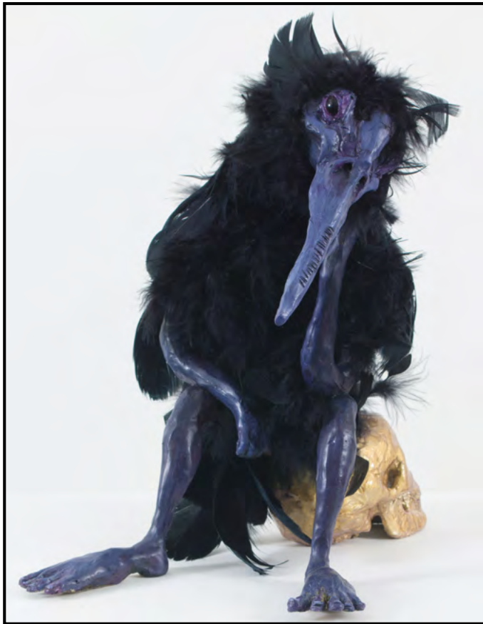
Nikki Schiro, Calcination: Igniting the Fire of Introspection.